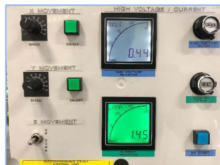
Figura 2 - Control Panel